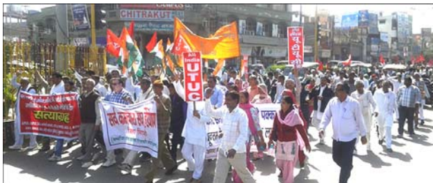
Massive law-violation programme Bhiwani, Haryana on 26 February

A massive law-violation programme was held at Bhiwani, Haryana on 26 February under the auspices of a united forum of leftist parties and trade unions.