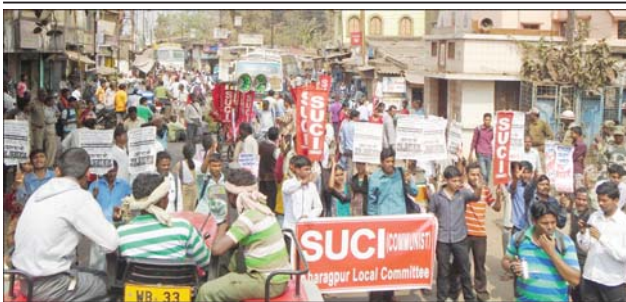
Road blockade at Kharagpur on 16 February in demand of reduced bus fares

AIMSS demands that speedy trials are conducted in each of these cases and stringent punishment awarded to the criminals."