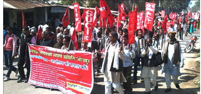
Joint rally on 10 February at Jaunpur, UP

including SUCI(C), CPI, CPI(M), RSP, Forward Bloc and CPI(ML) Liberation on 10 February. It submitted a memorandum highlighting a charter of demand to the President of the country, through the District Collector. The demands