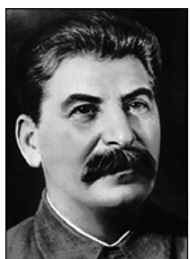
21 December, 1879 - 5 March, 1953

“The workers cannot trust their leaders when these leaders sink into the swamp of the diplomatic game, when their words are not supported by deeds, when the words and deeds of leaders do not coincide. Why have the Russian workers displayed such boundless confidence in Comrade Lenin? Merely because his policies were correct? No. Not because of that alone, but also because they knew that there was no contradiction between Lenin’s words and Lenin’s deeds, because they knew: ‘Lenin does not fool us!’