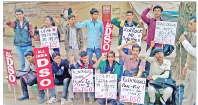
AIDS0 demonstration in Delhi against abolition of pass-fail system

As per another report and analysis of the Parliamentary Standing Committee of the Ministry of Human Resource development 46.5% of class 5 students are not even able to solve ordinary mathematics questions of two digits. In an international students evaluation survey based on reading ability, mathematics and science, etc. of students aged upto 15 years, the O.E.C.D has pointed out that India stands at 72nd position out of total 73 nations (above only Kirgizstan) which shows the