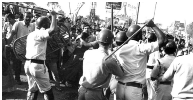
Barbaric lathi-charge by police on SUCI demonstrators in front of US embassy in Calcutta