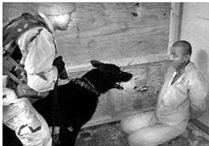
American soldier sets ferocious dog on Iraqi prisoner in Abu Ghraib prison

To get at the answers, we must first be clear in our understanding that the Congress which heads the present UPA government at the centre, or, as a matter of fact, also the BJP which led the former NDA government, are both bourgeois parties that sustain themselves, rise to power and craves for more only with the support of and working at the behest of the Indian monopoly capitalism. It is also a reality that the latter, Indian capitalism, as a part and parcel of the crisis-ridden world capitalist system, is itself tottering from unassailable market crisis; unbridled exploitation of the internal market by the Indian monopolists has robbed the majority of the common poor masses of people of the purchasing power. On the other hand, Indian capitalism has not just