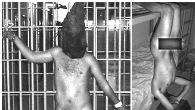
Barbaric torture on Iraqi prisoners in Abu Ghraib prison by US soldiers. Can President Bush deny his role and responsibility?

draining down the streets of the country; the Indian government, through its measures of disinvestments is allowing imperialist capital to make deep inroad, amounting to even gain control, in vital sectors of trade, industry and finance, including insurance, aviation and such others. The government nakedly supported the US and EU sponsored resolution of International Atomic Energy Agency impose restrictions on the nuclear energy programme of Iran. They signed the 10-year defence agreement between USA and India, another clear signal of the pro-US stance of the Indian ruling class. The Indian government is staging joint military exercises, including the joint air exercises of the IAF and USAF, is allowing the US army to use its bases for that purpose; it permitted the US warplanes to refuel from Indian ports during the Iraq war. All this presages a great threat to the country's sovereignty and future democratic movements. It cannot but help increase the scope for US interference in the political affairs of the country, particularly in the sensitive and vital area of defence and national sovereignty. Filthy imperialist culture hinged on