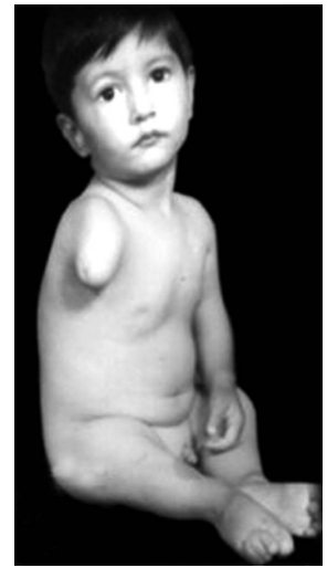
A victim of depleted-uranium bomb used by US army