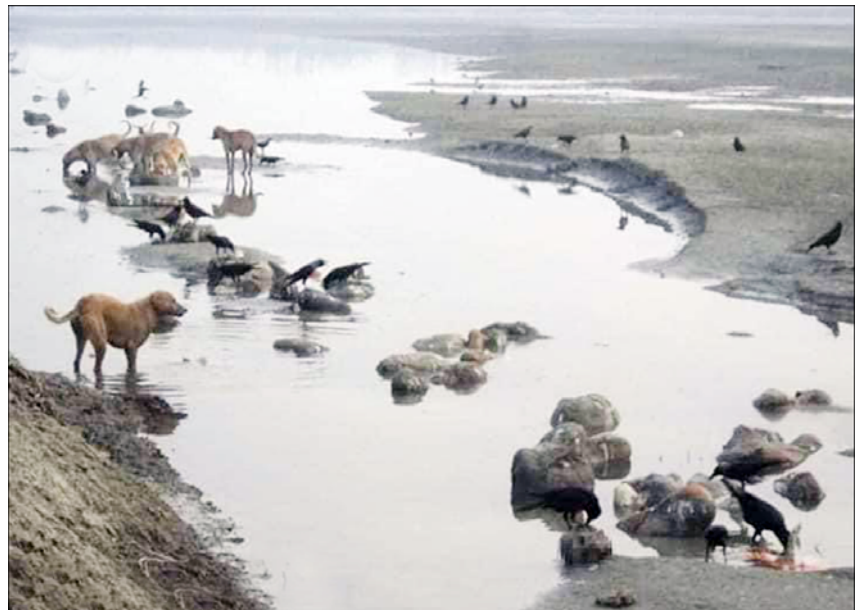
Dogs feasting on Covid dead bodies floating in the river in UP

Total trade between the countries from January to December 2020 stood at $77.67 billion (Rs 5,63, 000 crore) during the same period in 2020. Also, Indian iron and steel saw a 319.14 percent jump in exports to China, with shipments touching $2.38 billion (Rs 17,374 crore). Total trade with the US in 2020, at $75.95 billion, lagged behind China. (Indian Express and ABP dated 24-02-21)