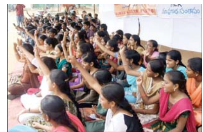
Vzaj in Andhra Pradesh

women, highly dented and painted". Short of calling the Kolkata's Park Street rape victim a prostitute, a woman Trinamool Congress MP commented that "it was not a rape case but a deal going sour between a lady and her client." From the rostrum of a public meeting, a former minister and now deputy leader of the CPI (M) in West Bengal assembly threw a question to the lady chief minister of West Bengal, "If you are raped, what will be the compensation you would charge?" All of them are leaders of their respective parties. They belong to different parties but share the