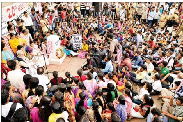
Bangalore in Karnataka