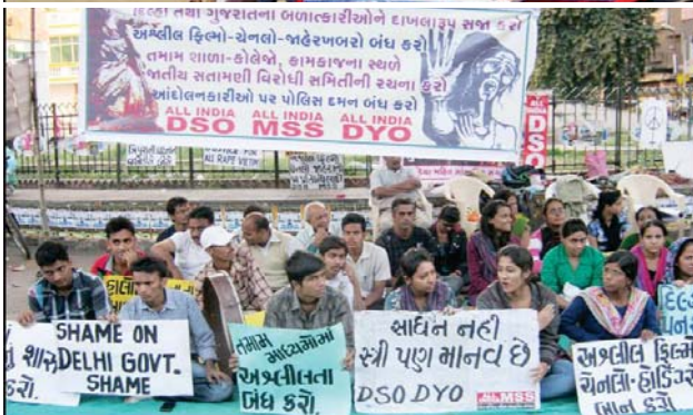
[Top] Chhattisgarh and Ahmedabad in Gujarat