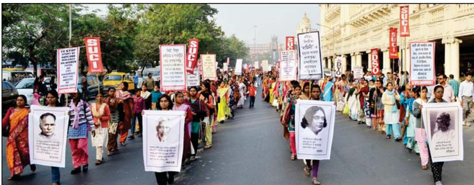
Kolkata on 29th December

Deeply pained at the virtual extinction of human faculties among the poor workers engaged in construction work site, great litterateur Saratchandra wrote many years back in his celebrated novel 'Srikanta': I am not grieved at the death of a human being because if one is born, one has to die one day. I am appalled at the demise of humane qualities. Greed of the rich for wealth has turned human beings into heartless animals. Because, the rich knows that unless the poor is brought down to the level of animals, they cannot be forced to work like animals. He had said this after seeing how capitalism was destroying finer senses, tender feelings, love, affection and benevolent mind. But he and his predecessors as well as contemporaries like Rammohan, Vidyasagar, Jotiba Phule, Vivekananda, Rabindranath, Lala Lajpat, Tilak, Gopabandhu, Jyoti Prasad, Subramanya Bharati, Premchand, Netaji Subhash, Nazrul did not live to see the horridness engulfing the country today and the escalating number of rape and gang-rape nor could they ever think of such adversity taking over. In the obscurantist bigot patriarchy-dominated feudal society of India under British imperialist rule, there was prevalence of medieval tortuous customs and practices like child marriage, burning the widow on the funeral pyre of husband