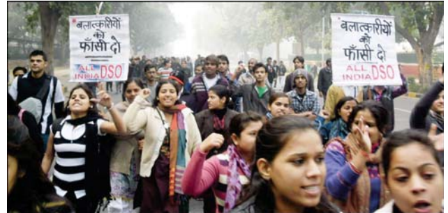
Joint protest rally by AIDS0, AIDYO and AIMSS in Delhi on 29 December

Delhi braving the biting winter and disdaining the batons, tear gas, rubber bullets and water cannons of the rulers. We hope that the flame and ferment of this battle would be