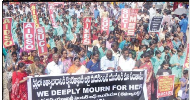
[Top] Jabalpur in MP and Anantapur in Andhra Pradesh