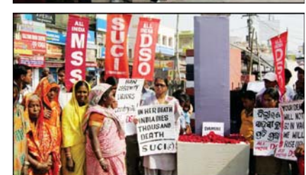
[Top] Assam, [middle] Tamilnadu and Jharkhand