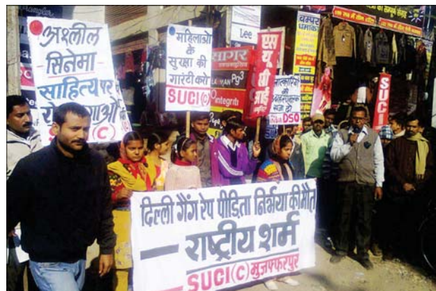
Muzaffarpur in Bihar