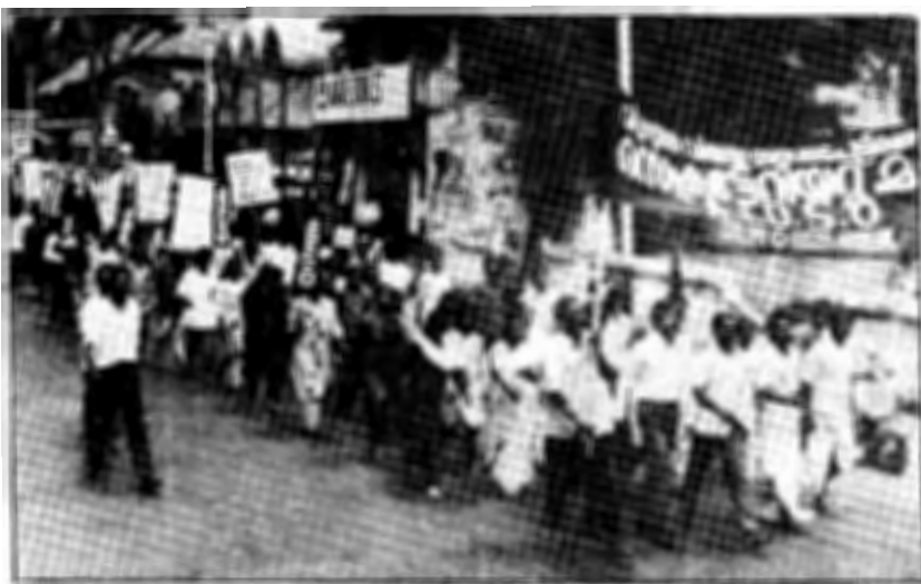
Students' demonstration from the Trivandrum Secretariat to the University

The Document also asserts: Capitalism has plunged in an allout and irreconcilable crisis and it has no way out -- its doom is inevitable. But capitalism will not crumble down of its own or automatically. To ensure its destruction a conscious and united struggle of the proletariat and a real revolutionary party capable of leading this struggle in a right course are the indispensable factors.