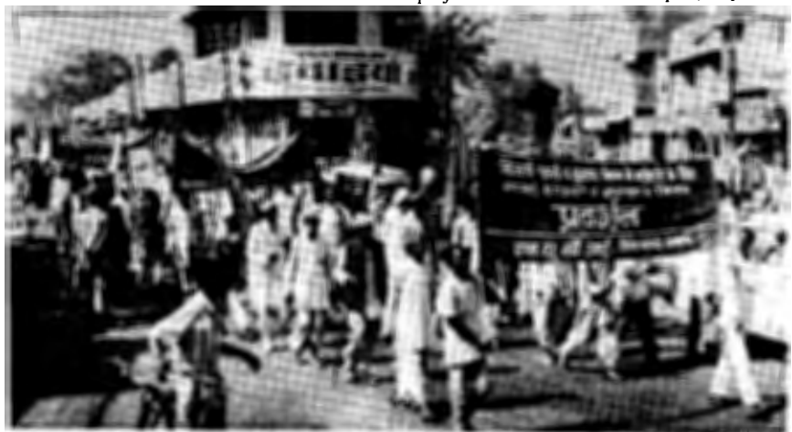
Protest Demonstration on 10th November parading the Rohtak Street.

Different speakers addressing the sit-in-demonstrations, said that aggravating problem of non-supply of power and water necessary for drinking and irrigation had added problems to life and coupled with unbound political corruption had intensified people's misery. The Central Congress (I) government had not yet formulated any national policy on water and electricity. The Opposition parties, in order to defend the present exploitative system, were not trying for a solution. They were using the problems in their narrow political interest by fomenting caste and regional feelings, ultimately even turning the people of one state or area against another. The recent agreement on Safety Yamuna Link (SYL) canal and other projects could be cited as examples, they said.