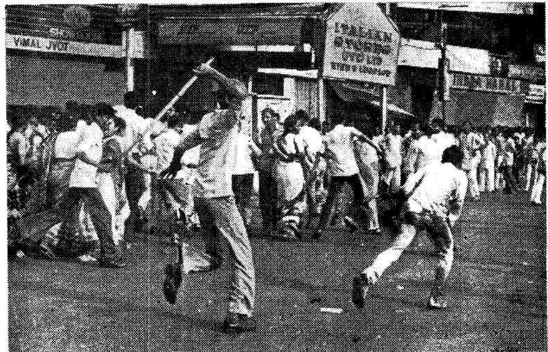
Who are they in plain cloth beating SUCI demonstrators?

The movement has drawn many youths who sprang forth in their youthful fervour against such gross affront to civilisation. They demonstrate in practice that undying is the call of humanity. The call will ring. The enemies of the people, of humanity and of civilization may stick in government by the benevolence of the moneybags, bureaucracy and drumbeatings of the bourgeois press but no doubt the call will be louder to announce their inevitable doom.