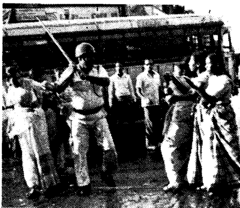
Police beat women demonstrators—Calcutta.

The speakers exposed the various aspects of the out and out anti-people character of the New Education Policy in details and appealed in one voice for a powerful movement to develop against it to defend the very purpose of education.