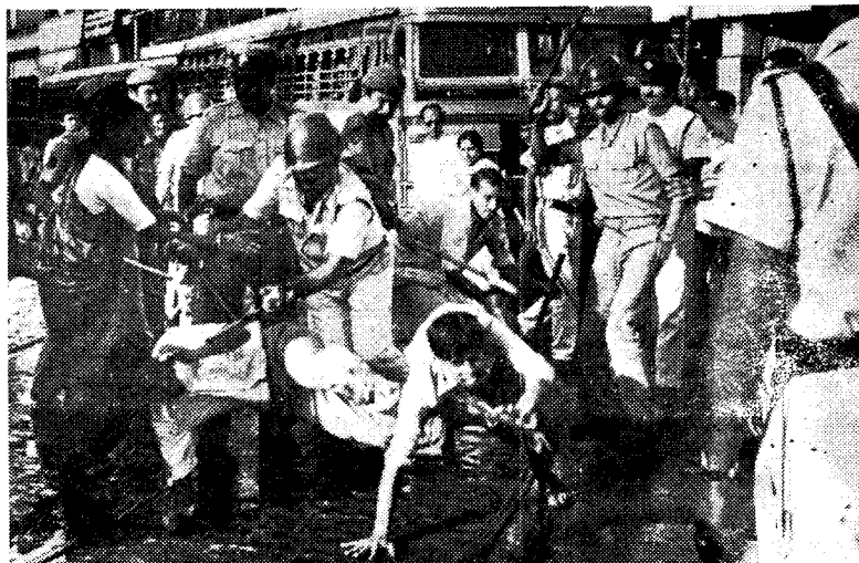
Savage police assault on SUCI demonstrators during movement against bus fare hike in Calcutta.

The procession in Trivandrum started from Tri-