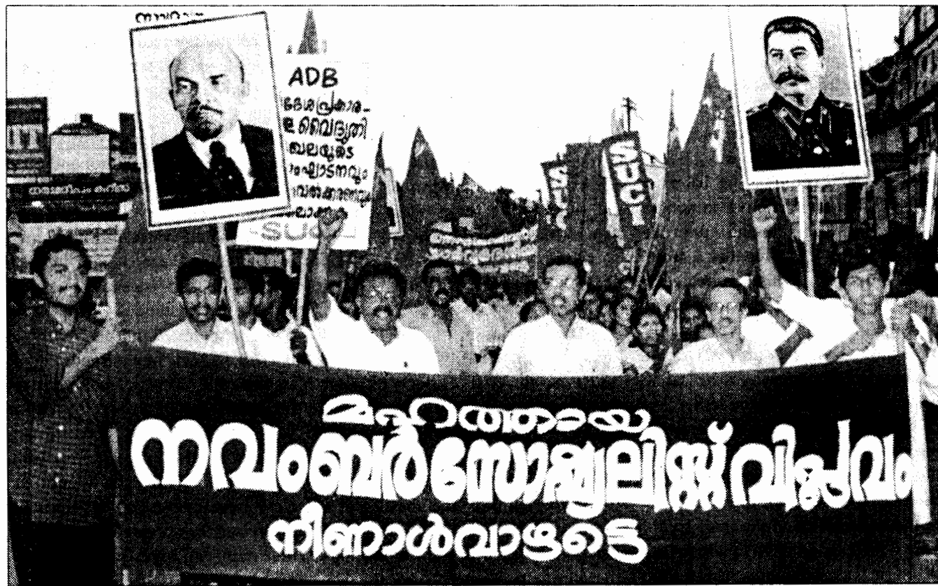
← November Day Rally in Kerala

undertake bids to devise means of countering disasters in the near and distant future. So, in that perspective, and that is the only and true perspective to be considered, the cause lies in the human social organization — whether the social system and the law binding it does or does not allow priority to the danger of environmental catastrophe for its population and to doing everything possible to eliminate the danger and protect the masses of people. Here comes why the capitalist order with its law of earning maximum profit ought to be reckoned the ultimate and root cause. So long capitalism-imperialism would exist with the motive of extraction of maximum profit, this apathy to the people's cause would continue unabated. It needs development of higher level of consciousness and awareness among the people regarding the issues of environment, which requires developing people's movement against the criminal attitudes of the governments to the issue of environment protection.