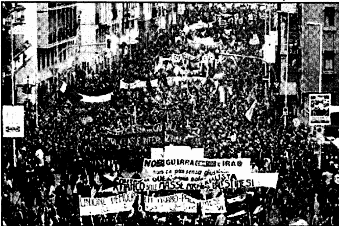
Over 5,00,000 people from all over Europe march in Florence, Italy on 9 November, 2002 against US war threat on Iraq

"We appeal to the peace-loving, democratic minded people across the country and all over the world to launch a strong and powerful movement against any possible attack on Iraq at any moment."