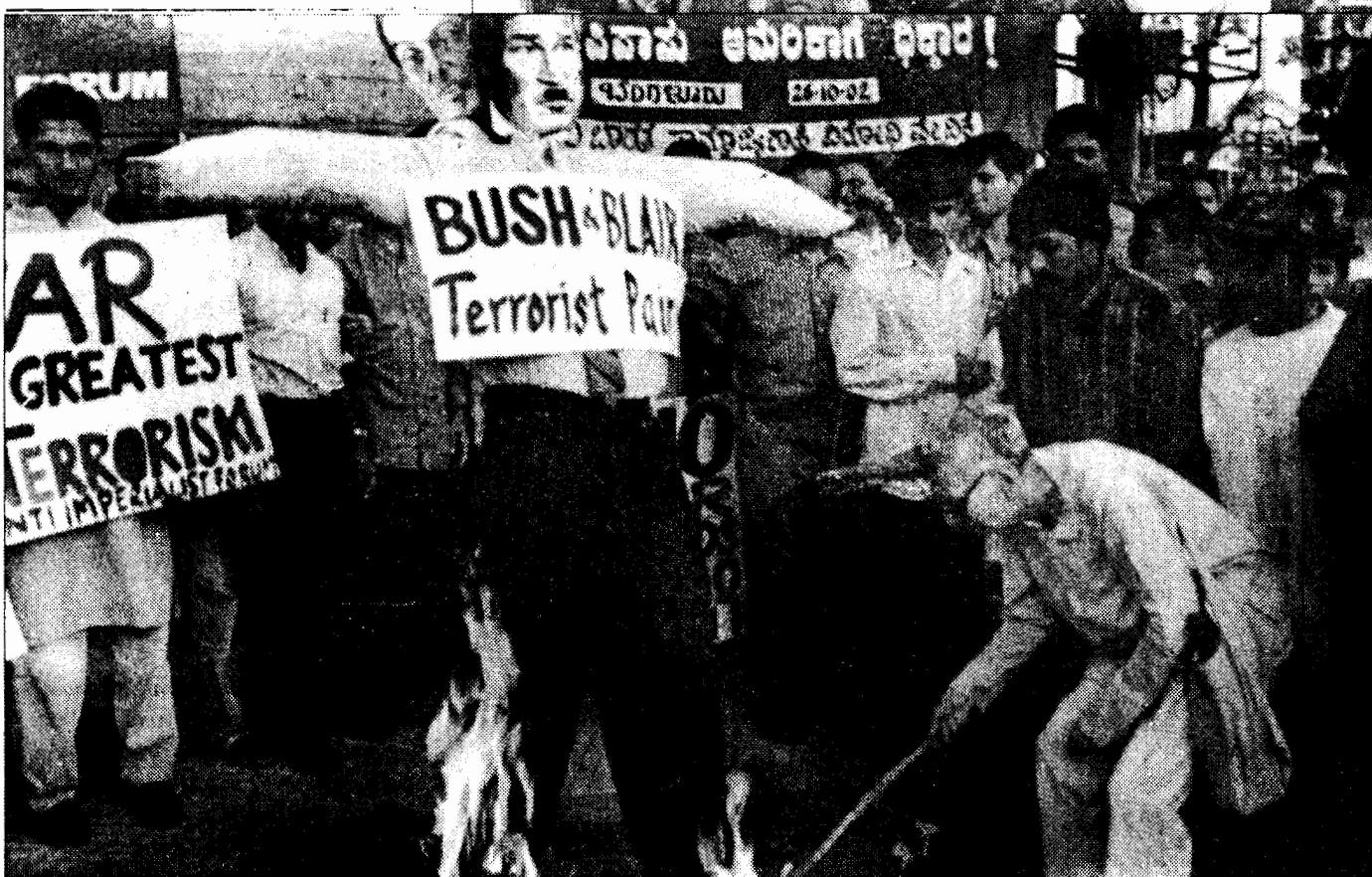
(Top) All India Anti-Imperialist Forum, Tamilnadu stage a anti-war protest demonstration against US war design on Iraq on 26.10.2002 in Chennai.