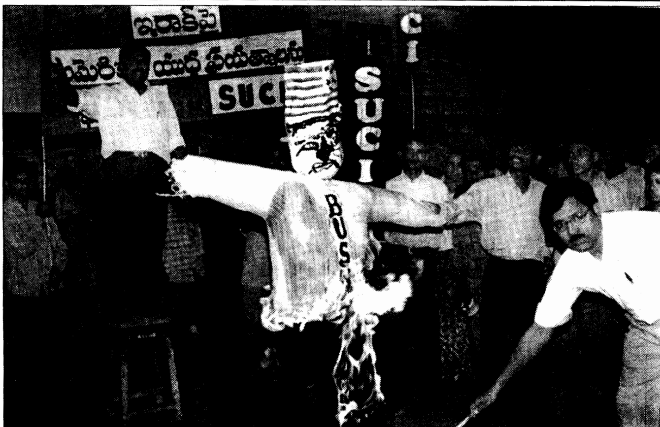
(Left) SUCI, Andhra Pradesh State Organizing Committee held an anti-war protest demonstration on 26.10.2002 in Hyderabad. Effigy of Bush was burnt. (More photos on page 6)

Assigning 200 million US Dollars cannot clean the American hands that are stained with the blood of Afghan and Palestinian children.