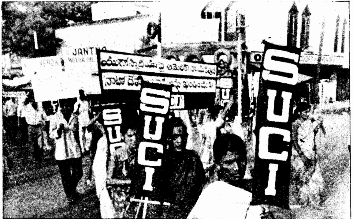
Part of the procession in Hyderabad on 24th April, '99 the Party Foundation Day