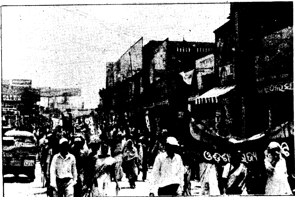
Part of the procession towards Saheed Bhawan, Cuttack, Orissa on 24th April, Party Foundation Day