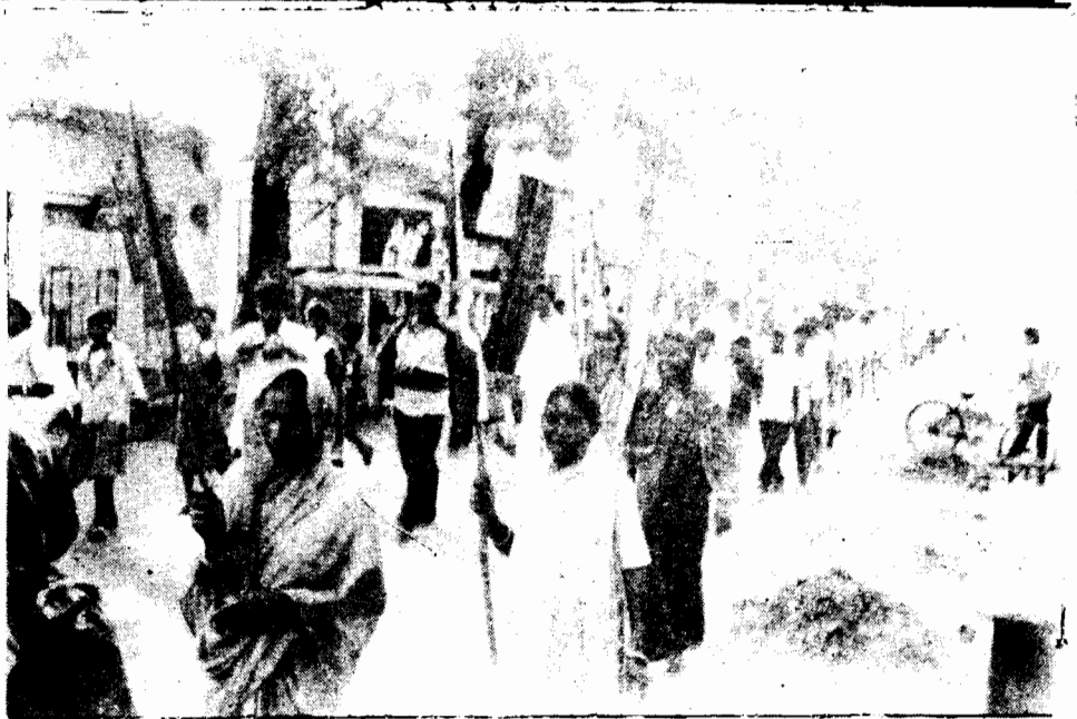
Procession in Ghatshila, Bihar on Party Foundation Day

Two resolutions, one demanding halt of savage attacks on Yugoslavia by NATO and the other demanding scrapping of death sentence on Mumia Abu Jaamal, leading activist of anti-