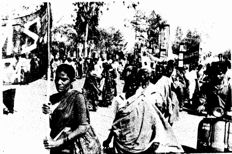
AIMSS procession at Patna on 8th March, 1999 (News inside)

One element of success they possess numbers ; but numbers weigh only in the balance, if united by combination and led by knowledge... (Address and provisional rules of the Working Men's International Association — September 28, 1864).