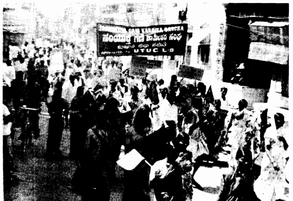
Mine Workers' procession on 21.2.99